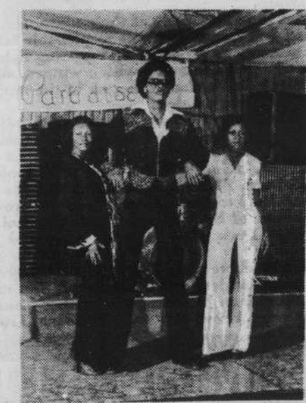
TIME: 10:00 P.M.