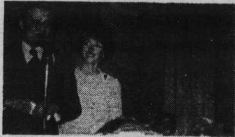
The Vice-President Walter Mondale & his wife at their beautiful party.