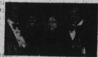
The Burneys & the Preddys strolling in for a time of their life.