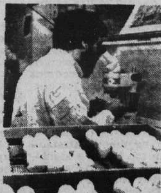
HOW NERVE CELLS GROW before birth is studied in chicken embryos by Boston researchers. They use a dissecting microscope purchased with March of Dimes funds.