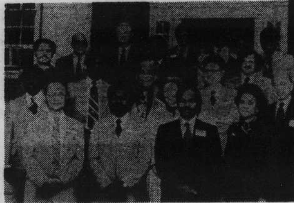
PICTURED ABOVE AT THE OCTOBER 1976 meeting in Atlanta are the Members of the Board of Overseers for the Morehouse College Medical Education Program. The program, planned to become the third predominately black medical school in the country, will admit its first students in September of 1977.