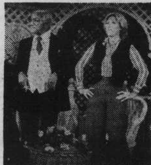
HIP STANCES are taken by Redd Foxx and Dinah Shore on 20th Century Fox's DINAH! On the show Dinah salutes TV Its Very Special People, of which Foxx is one. DINAH! can be seen Nov. 17 in Las Vegas.