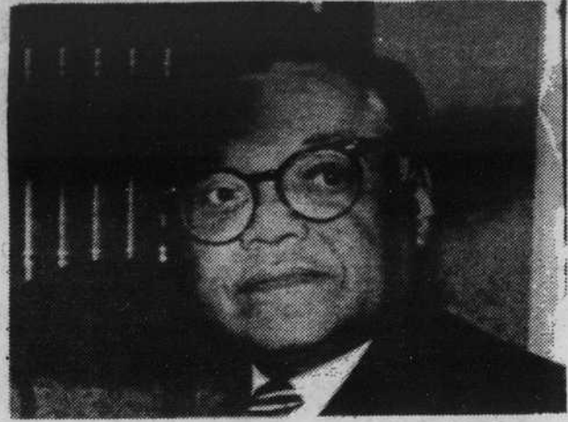
Highest Ranking Black Government Official to Address NBL Convention

124 W. BROOKS AVE. NLV EQUAL OPPORTUNITY EMPLOYER