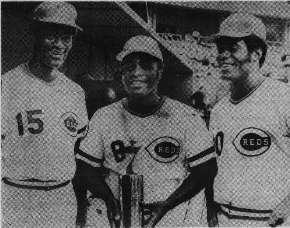
CINCINNATI TRIPLE: Joe Morgan (center), current leader in the Seagram's Seven Crowns of Sports $10,000 computer baseball competition, is getting a stiff challenge from a pair of his Cincinnati teammates, Ken Griffey (right) and George Foster, who are third and fifth, respectively, in the Seagram program. It's the first time three players from the same team have ever placed in the top five. Morgan is the defending Seven Crowns champion, having won the $10,000 with his MYP performance in 1975.