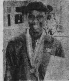
ROSALYN BRYANT has qualified for the semi-finals in the 400-meter sprint at the Olympic Games in Montreal Canada. Ms. Bryant was clocked at 51.74. The Olympic sprinter appeared in Las Vegas for the UNLV Invitational in 1975 and 1976.