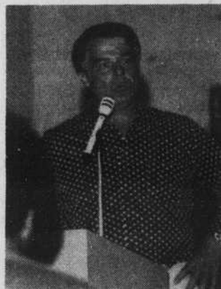
Mayor of Las Vegas, Bill Briare