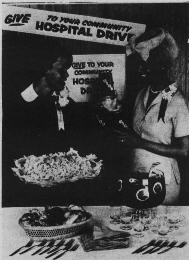
TUNA PATIO SALAD

Fund-raising projects are one means of helping worthwhile organizations in your community meet the high cost of living. In planning for such events, you must keep in mind a way to make the most money possible for the charity involved. One such fund-raising event could be a buffet dinner. Two excellent recipes to keep you within budget, satisfy those in attendance, and make money for your favorite charity, are Kaleidoscope Punch and Tuna Patio Salad. The punch recipe uses unsweetened Kool-Aid, the soft drink mix that is economical, tasty, enjoyed by both adults and children but also contributes some vitamin C, A, calcium, and phosphorus at the same time. Tuna Patio Salad provides a nutritious entree that extends the tuna by using Minute Rice and Birds Eye 5 Minute Sweet Green Peas. These stretchers not only minimize the total cost of the salad, but also make preparation easy with a minimum amount of time spent. All of these factors, as well as nutrition, are important to homemakers whether they are preparing food for the family or outside the home.