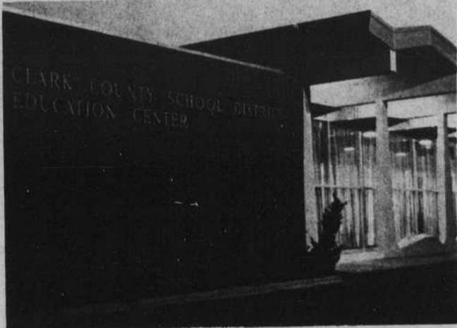
Headquarters for the central administration of the Clark County School District are at 2832 East Flamingo Road, near Eastern Avenue. Opened in August 1964, the Education Center houses the offices of Kenny C. Guinn, Superintendent of Schools, and four specialized divisions: Personnel, Business, Administration and School Facilities.

Directly south of the Education Center and facing Eucalyptus Drive are the District's Warehouses and Maintenance buildings completed in 1966. The Transportation Department is located at 4499 West Harmon Street in Las Vegas. Educational Television operates out of Southern Nevada Vocational-Technical Center, Mountain Vista and Russell Roads.