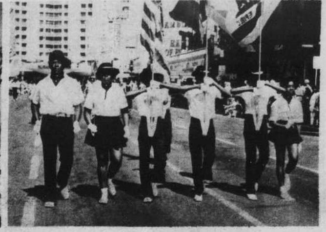
PACESETTERS--The Pacesetters came from San Bernadino, Calif., Saturday, to take part in the Afro-American Unity Festival parade. The group is noted as one of the best drill teams in the United States.