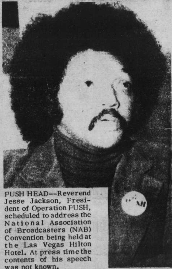
PUSH HEAD --Reverend Jesse Jackson, President of Operation PUSH, scheduled to address the National Association of Broadcasters (NAB) Convention being held at the Las Vegas Hilton Hotel. At press time the contents of his speech was not known.