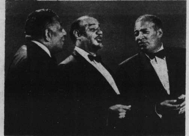
MILLS HONORED-The Mills Brothers celebrated their 50th anniversary in show business at the Riviera Hotel. Don Rickles paid tribute to the trio at the end of one of his shows. The brothers started their professional career in Ohio in 1925. They first started to sing in their father's barber shop in Piqua, Ohio, in the early 1920s. They are currently co-headlining at the Riviera with Rickles.