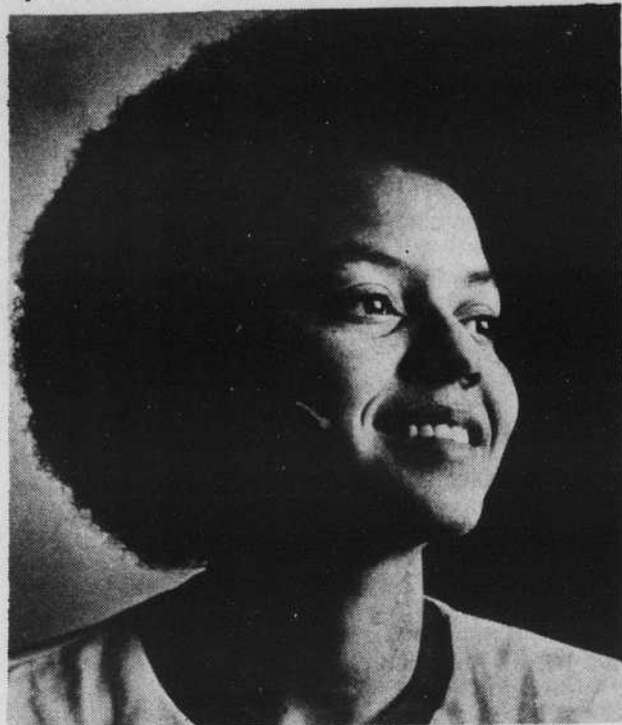
Born in Knoxville, Tenn., and raised in Cincinnati, she graduated with honors in history from Fisk University. Her early poems and writings reflect a militant viewpoint. Later poems reveal

"People are lonely," she says. "They sit in groups but they go home alone. I am a poet, and I try to soothe."