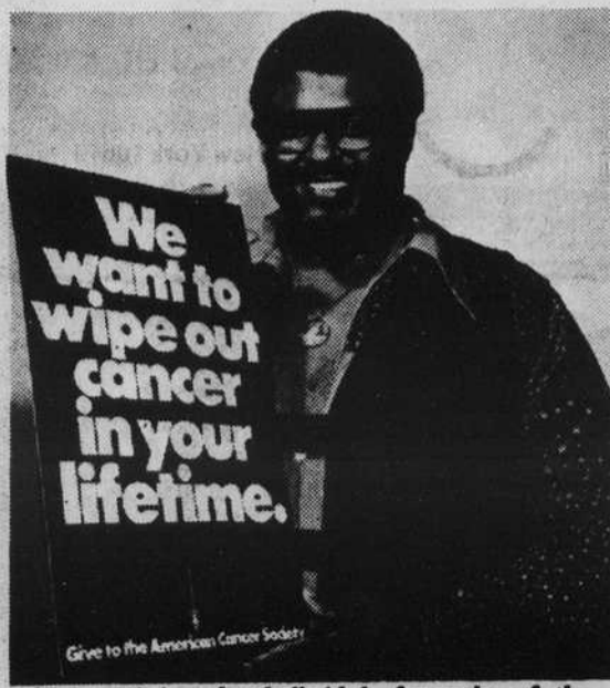
Rosey Grier, football idol, formerly of the New York Giants and the Los Angeles Rams, urges everyone to support the American Cancer Society's fight against cancer. He displays the poster that announces the Society's goal - "We want to wipe out cancer in your lifetime."