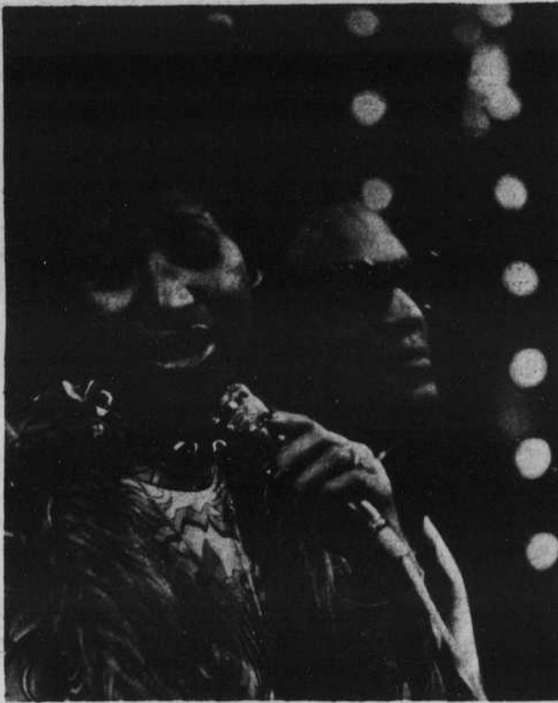
ARETHA FRANKLIN and RAY CHARLES make a rare television appearance together on "The Midnight Special" spectacular celebrating the show's second anniversary on NBC, Friday, January 31. Also performing together on the show, which follows Johnny Carson, are Gladys Knight with B.B.King. Hostess is Helen Reddy and other guests include Dave Bowie, Bachman-Turner Overdrive, Joan Baez, the Doobie Brothers, Bobbie Darin and the Byrds.