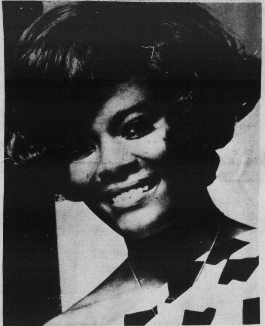
DIONNE WARWICKE 'VOICE' Photo Pic Of The Week