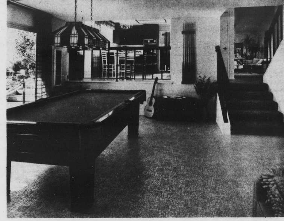
The new tri-level plan at Laurelwood Homes in Spring Valley features living on three levels with a 273-square foot step-down family room that also includes a wet bar.

The $100 million community is scheduled to