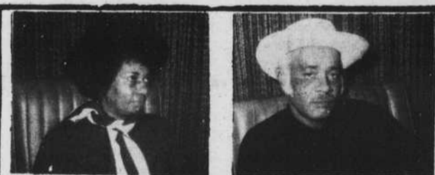
"COMPLETE BAIL BOND SERVICE AROUND THE CLOCK"

The Sickle Cell test is available to anyone over 2 years of age.