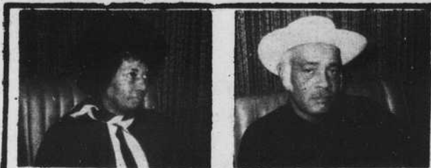
"COMPLETE BAIL BOND SERVICE AROUND THE CLOCK"