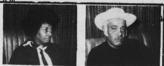
"COMPLETE BAIL BOND SERVICE AROUND THE CLOCK"

The Economic Opportunity Board of Clark County's Family Planning Component, continues to provide Sickle Cell Screening and counseling. Tuesday and Thursdays from 5:00 p.m. to 8:00 p.m.