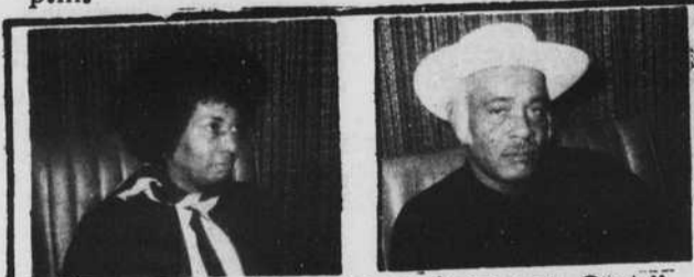
"COMPLETE BAIL BOND SERVICE AROUND THE CLOCK"

The Economic Opportunity Board of Clark County's Family Planning Component, continues to provide Sickle Cell Screening and counseling. Tuesday and Thursdays from 5:00 p.m. to 8:00 p.m.