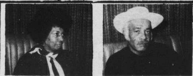
"COMPLETE BAIL BOND SERVICE AROUND THE CLOCK"

Our purpose is to screen every family in Clark County at no cost. No one will be denied the test. The Economic Opportunity Board's Family Planning Staff will go into any group organization for the purpose of Sickel Cell Testing and counseling at time convenient to the Community.