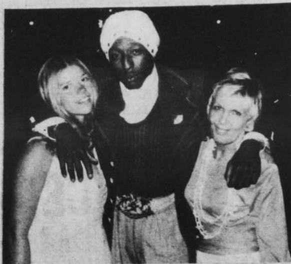
Sweet Will & Company

Seagram's 7 Crown. It's America's whiskey.