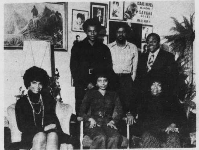
Introducing Nevada's first "Black" Theatrical Agency and Production Company.