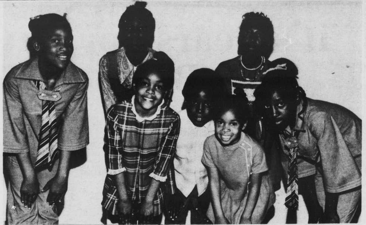
NEW SINGING GROUP - These students from Lincoln Elementary, all members of two families, have developed a new singing group that has been performing at the school. Called the

AB 492 - Allows certain additional individuals (see BENNETT, page 9)