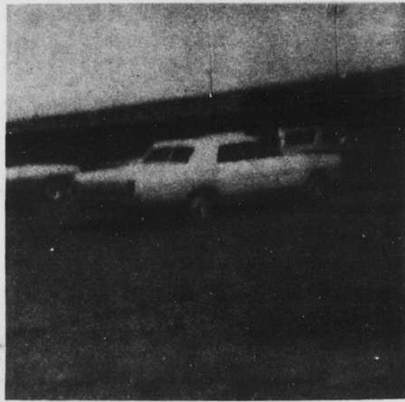
MATT KELLY SCHOOL