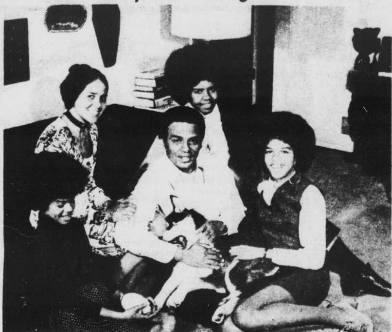
The Andrew Young family.

ATLANTA, GEORGIA — Andrew Young has taken a giant stride toward becoming the South's first black Congressman since 19th Century Reconstruction by winning the Democratic nomination for Georgia's 5th District in the primary election August 8.