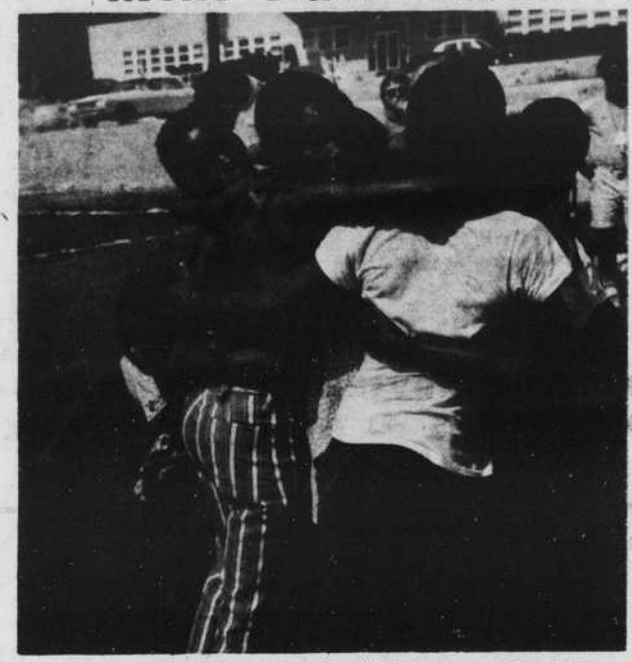
The St. James Mini-Park Team at the Las Vegas Recreation Department Rounders Championship.