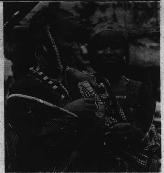
Smiling Faces greet visitors on Air Afrique's All Africa Wonderland Tours to West and East Africa. These young girls, dressed in hand-printed robes and embellished with gold and ivory jewelry of traditional designs, live in the North Cameroun near the game-rich Wazza Park, a safari highlight on one of the available tours.

Students who buy lunches will pay 40¢ in elementary schools and 45¢ in junior and senior high schools.