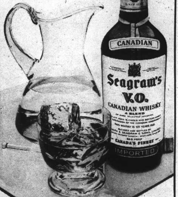
CANADIAN WHISKY—A BLEND OF SELECTED WHISKIES. 6 YEARS OLD. 86.8 PROOF. SEAGRAM DISTILLERS CO., N.Y.C.

Very special. Very Canadian. Very right.