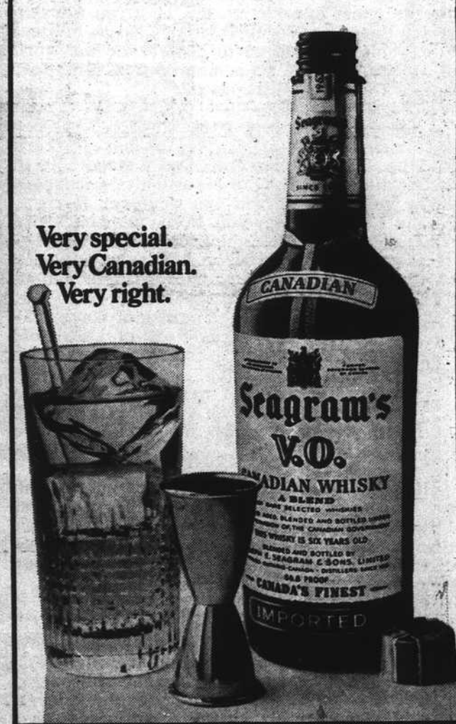
MADIAN WHISKY—A BLEND OF SELECTED WHISKIES. & YEARS OLD. 86,8 PROOF, SEAGRAM DISTILLERS CO., IL.Y.

Seagram's V.O. Canadian. For people who like everything just right.