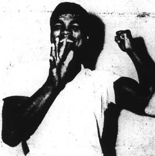
MUHAMMAD ALI RETURNS TO RING