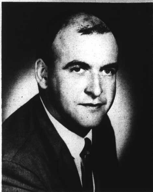
GOVERNOR-ELECT: MIKE O'CALLAGHAN