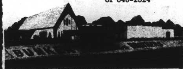
925 LAS VEGAS BLVD. NO.

GOLDEN RULE Funeral Service Do unto others as you would have others do unto you.