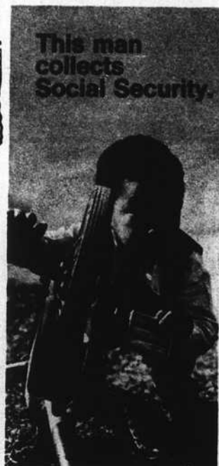
This man collects Social Security.

More information may be obtained by visiting or telephoning the Federal Job Information Center at 300 Las Vegas Boulevard South, Las Vegas, Nevada 89101, telephone 385-6345.