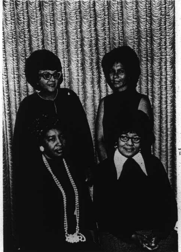
Members of Gamma Phi Delta Sorority, Inc. Alpha Rho Chapter are busy getting ready to present the 13th Annual Ebony Fashion Fair, Dec. 4 at the Sands Hotel at 8 p.m. No host cocktail party at 6:30. Come early.

Her biggest point however, was being a candidate for Homecoming Queen. In a history of many years, there has not been a Black Queen to represent our Black ball players.