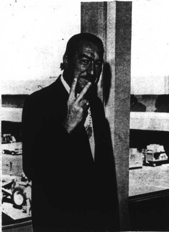
ADAM CLAYTON POWELL Strikes pose at Mc Carran Airport.