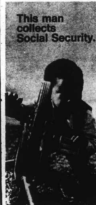
This man collects Social Security.

More information may be obtained by visiting or telephoning the Federal Job Information Center at 300 Las Vegas Boulevard South, Las Vegas, Nevada 89101, telephone 385-6345.