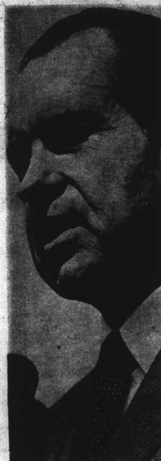
Stubborn President Nixon believed to be losing reported Gallup Poll gains with Negro voters.