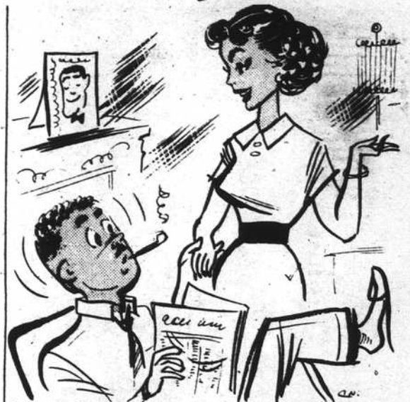
"I DIDN'T KNOW WHAT REAL HAPPINESS WAS 'TIL I MARRIED YOU, THEN IT WAS TOO LATE!"