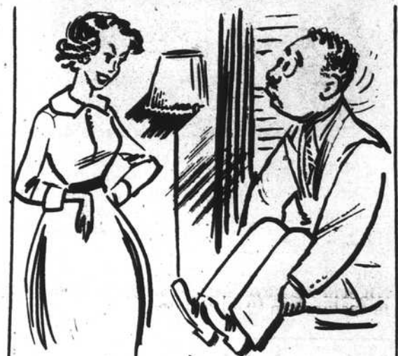
"WELL, IF I WERE IN YOUR SHOES I'D GET A SHINE!" CONTINENTAL FEATURES

***** Support Merchants Who Support Your Press *****