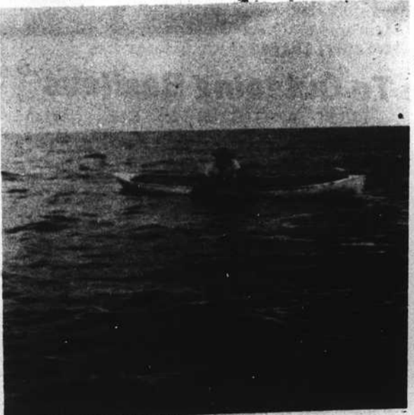
NATIVE LOBSTER DIVER hunting over Barrier Reef about 15 miles out... Gadget in hand is a viewing box which lets him see bottom with no sun reflection. When he spots one, he takes off his hat, dives in and catches the spiny tail with a hook made of a piece of bent wire.