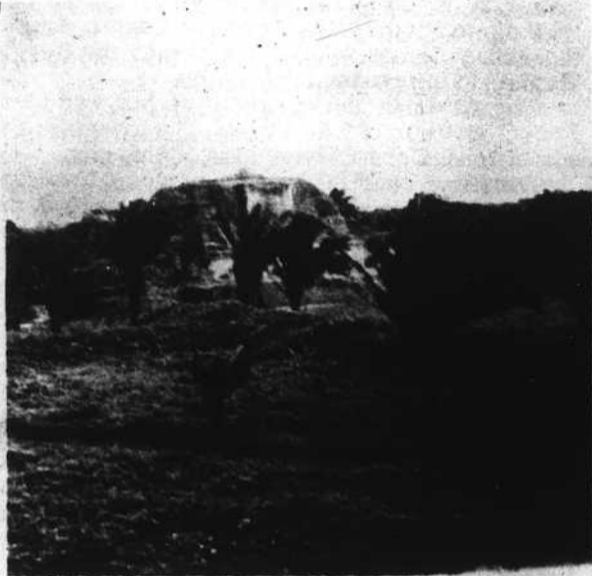
PARTLY EXCAVATED TEMPLE at Altunha, 30 miles from Belize City. Maya ruins at Altunha are the most recent discovery... Excavation has been going on for 3 years - will probably go another 5 to 10 years before completion.