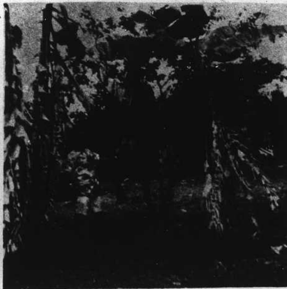
NEWTON UNDER BANANA TREE (ain't no apples in this paradise)... These banana trees are near Maya city of Altunha. Note that the bananas grow with their free ends pointing up - not as seen in market... Check right over CC's head - you probably missed them on first inspection.