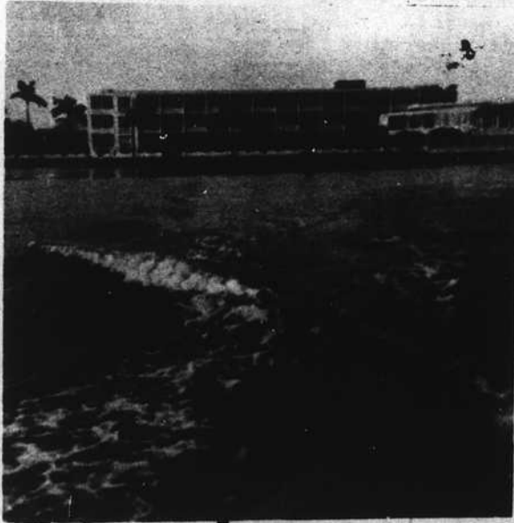
FORT GEORGE HOTEL , Belize City...Top hotel in nation. Small, but top cabin. 34 rooms - excellent cuisine; 14 to 24 clams per day, Modified American Plan, which includes breakfast and dinner where you pitch till you win. They couldn't stand Rocci - he would murder 'em (Rocci West, that is).