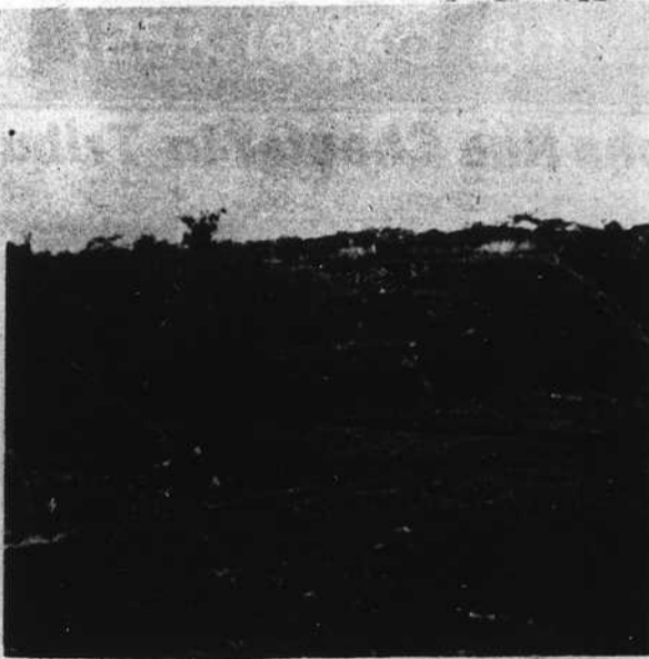
UNCOVERED TEMPLE in background. Texas Guinan's joint under construction in foreground (The reader should know of the Crappie Catcher's adoration for Texas Guinan).