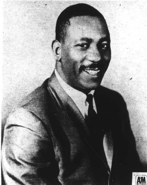
(WES, from page 9)

other hand, no sounds or rythms can be called wrong or impossible when you're being led by your ear, coupled with imagination. After all, it's the imagination which creates the style, while the ear keeps it in check and makes sure it's sounding right."