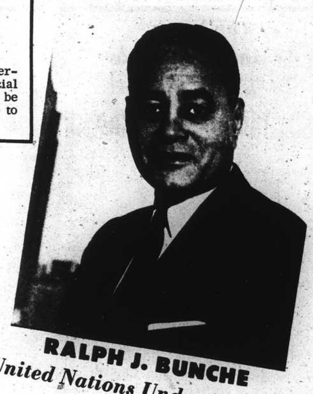
United Nations Undersecretary

Luthuli, held in exile in his own tribal territory in South Africa, required a special act of the South African Parliament to be released from his exile to make trip to Norway to receive his award in 1961.