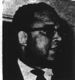
CHARLES C. DIGGS JR.