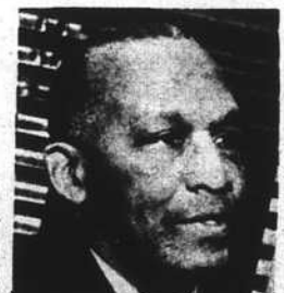
ROBERT N. C. NIX SR.