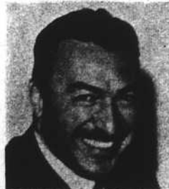
ADAM C. POWELL JR.