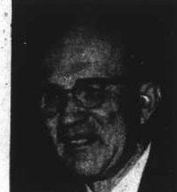
AUGUSTUS F. HAWKINS