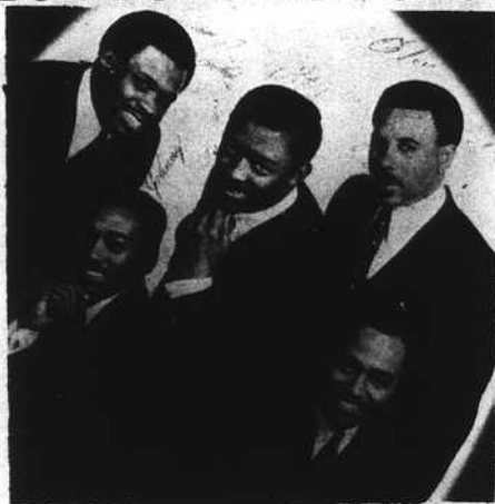
The Melody Kings

" LATHERNETTES " of the San Francisco Bay Area