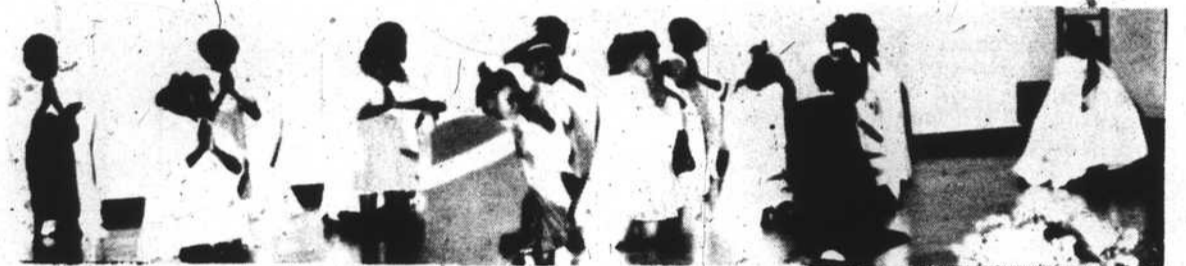
A MOVING MOMENT at the Harvest Tea was presentation of Zion Methodist Children's Group "Interpretation of The Lord's Prayer."