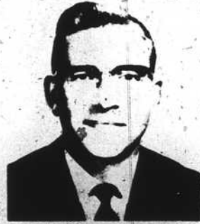
Governor GRANT SAWYER