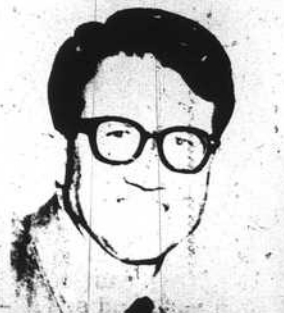
Candidate Lt. Governor JOHN FOLEY