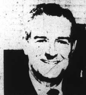
Texas Governor JOHN CONNALLY