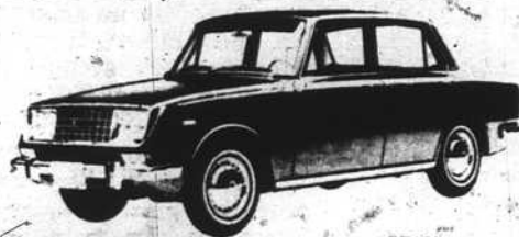
RT43L 4 DOOR SEDAN

The new legislation counters these complaints by requiring that most of the housing be for the poor. As many as 60 cities will be the locations of "Demonstration Cities" rehabilitation projects during the next two years. Some $924 million would be available for rehabilitation work.