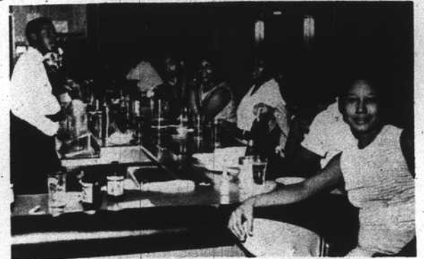
ONE CUSTOMER at the Black Orchid Bar could care less about a nosy photographer. Hope he made his point.