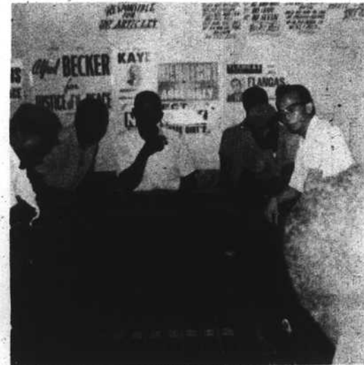
FIVE WILL GET YOU TEN that this is no political meeting despite the campaign signs in the background....Better odds are that if a candidate walked into the Louisiana Club at the moment to make a pitch, he'd be sure to lose, at least, six votes. What do you think the shooter's point was?