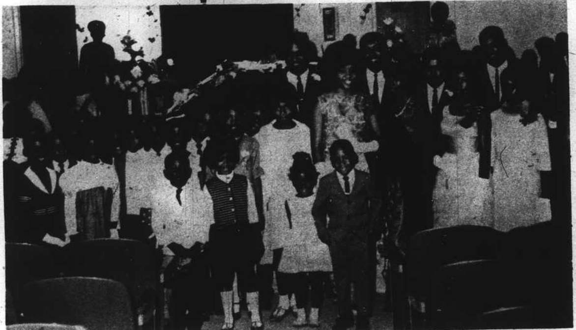
YOUTH DAY PROGRAM at Bethel Baptist Church Sunday last was a smashing success.... Among the multi events of the evening's program were a delightful Tom Thumb Wedding and a Fashion Show--Pictured here are participants in the program.