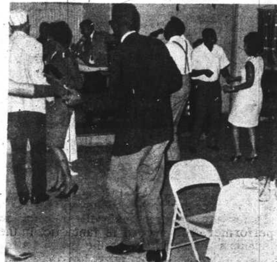
FROM ANY ANGLE, the Elk's Party was jumping.